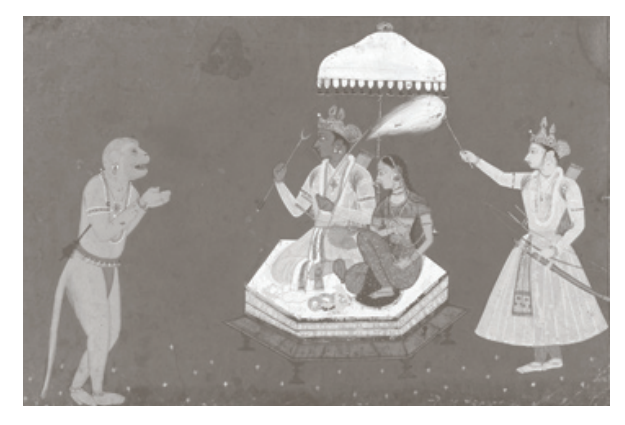
A depiction of King Rama, a popular deity in south and southeast Asia.

You belong to the Travelers, haplogroup U , which emerged around 60,000 years ago, not long after the first modern humans left Africa. Because the Travelers are so old, they've had many descendants who migrated to new areas and formed subgroups. As our DNA test and matching conventions progress, we may be able to match you to a U subgroup. For now,