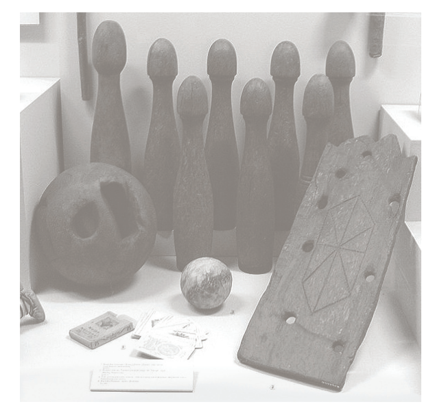
A Basque bowling game.

Basque populations indicates that their ancestors may have arrived in Iberia around 30,000 years ago. A unique modern day population, the Basque people self-identify as a discrete ethnic group in north-central Spain and southwestern France. Early Basque culture was basically democratic and their pre-Christian religion was formed around a superior female goddess, Mari. A rich mythology of Basque creatures and characters includes imps, giants, dragons, soothsayers and other nature-based deities. Traditional Basque cuisine was dictated by the mountains and sea surrounding Basque country. Lamb, fish and beans are typical ingredients of a Basque meal. The lan-