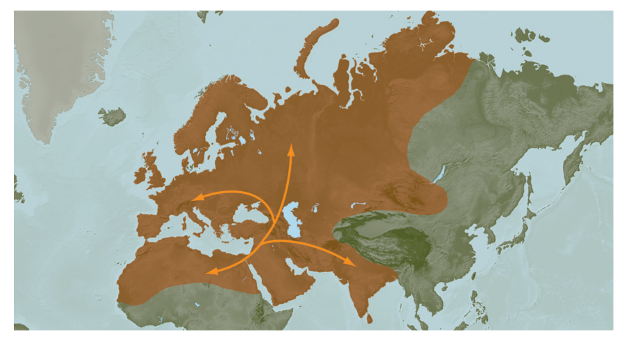
Your maternal ancient ancestors traveled this path-settling for various periods of time at points along the way.

Over 1,300 miles away, ancient Sri Lanka was believed to be progressive in many ways, establishing